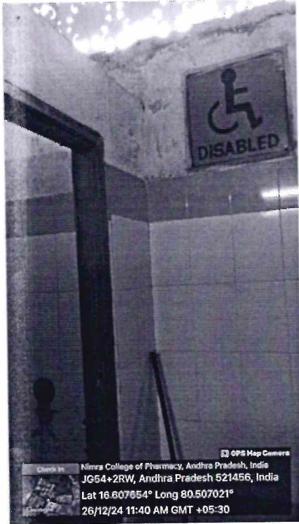
PHYSICALLY DISABLED TOILET

7.1.7 The Institution has disabled-friendly, barrier free environment Built environment with ramps/lifts for easy access to classrooms. Disabled-friendly washrooms Signage including tactile path, lights, display boards and signposts Assistive technology and facilities for persons with disabilities