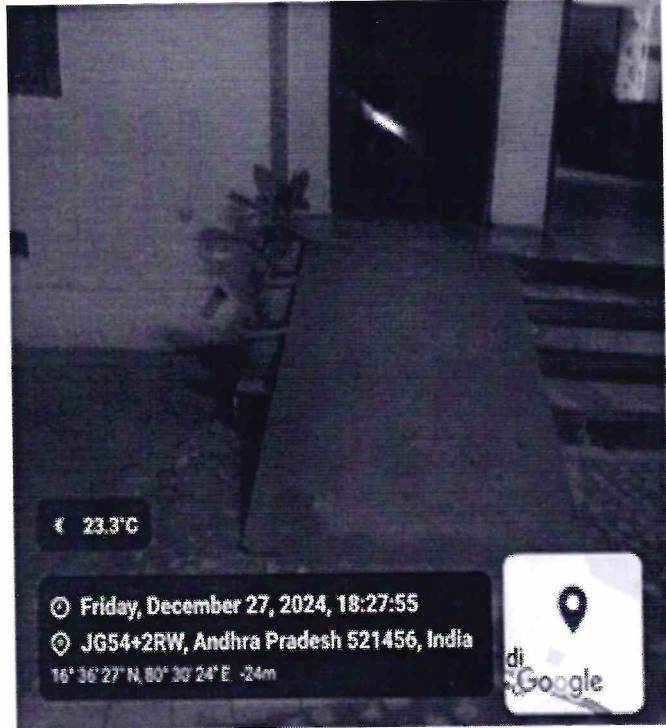
PHYSICALLY DISABLED RAMP